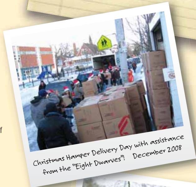
Christmas Hamper Delivery Day with assistance from the "Eight Dwarves"! December 2008

Finally our own local Santa Claus Parade and we owe it all to Community Centre 55. A great example of community and business working together to improve the quality of life in our neighbourhood. Very well done!